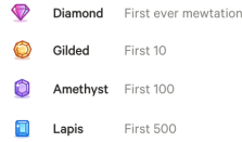
Fig. 2. Family Jewels

The key is a kitty who has Diamond, which represents the pioneer of that Cattribute. Assuming that the value remains the same as more kitties of the same Cattribute, if a player gets a Diamond kitty, his earnings will be greater. Specifically, he gives birth to 499 kitties so that all of them inherit Diamond kitty's Cattribute and gets family jewels. He will get 9 Gilded, 90 Amethyst, and 400 Lapis kitties. Selling all kitties, his earnings will be 14.4 Eth. (0.5 * 9 + 0.07 * 90 + 0.009 * 400) Thus, the player who has a Diamond kitty will gain a lot of profit. Then, in order for this to happen, you need to win the auction or mutate and give birth to the Diamond kitty.